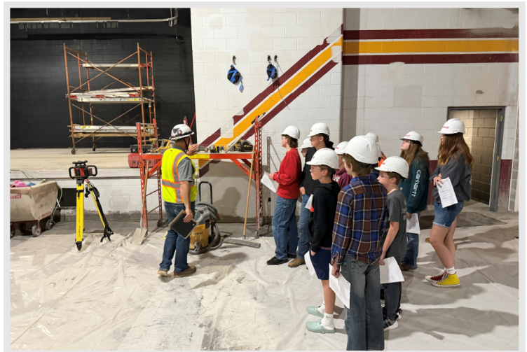
Last week we welcome some of the middle school students in the renovation area to learn more about the trades. Students had the chance to meet with the mechanical, electrical, and general trades contractors to ask questions and learn more about the different construction careers..