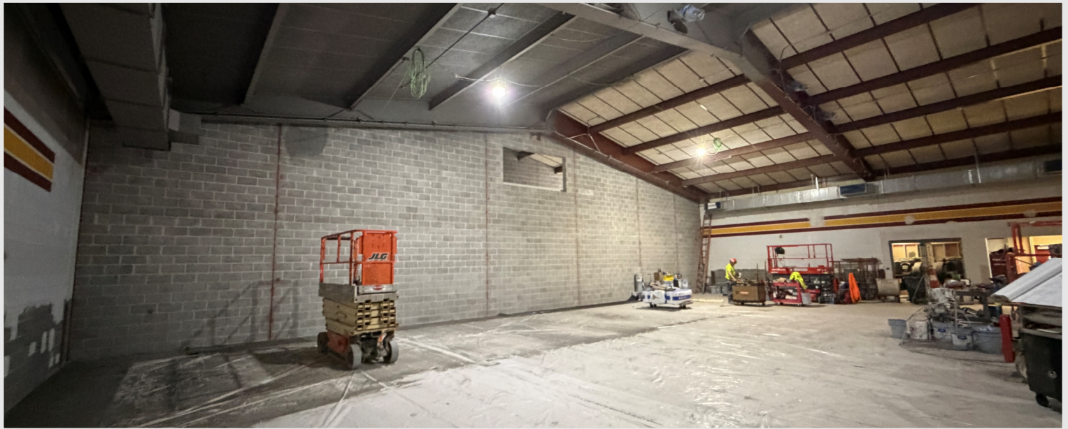
A look inside the PAC before painting was complete.