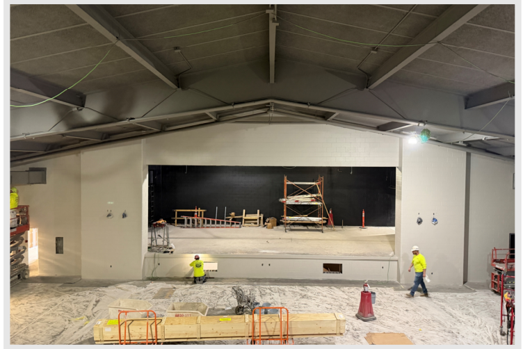
A view of the stage from the newly framed mezzanine control room.