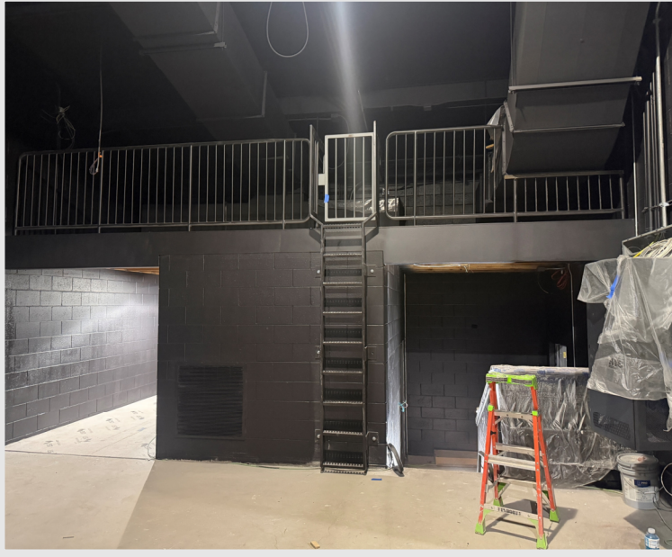
The railings and ladder have been installed for the stage mezzanines providing access to the school for more storage.

////////////////////////////////////1200 North Street • Rib Lake, WI ////////////////////////////////////// PAGE 2