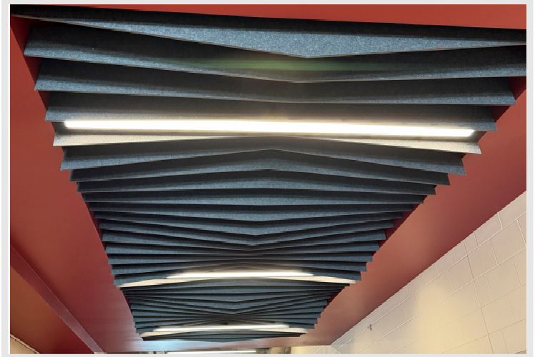
The acoustical accent ceiling has been installed above the trophy case.

Looking ahead, crews have begun returning to site as we prepare to start the next phase of work in the existing gym. Demolition and abatement coordination is ongoing, and the mechanical, electrical, and plumbing trades are eager to access their next work area.