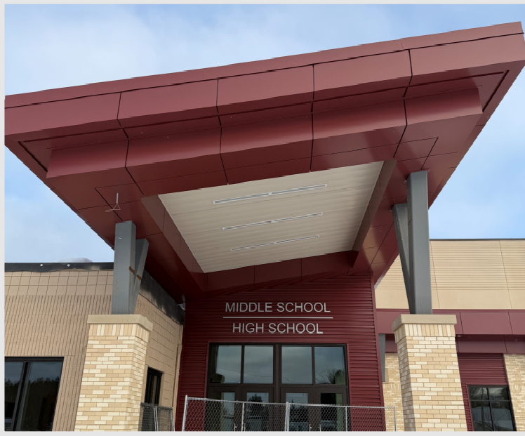
The soffit and metal panel have been completed on the main entrance vestibule.

////////////////////////////////////1200 North Street • Rib Lake, WI ////////////////////////////////////// PAGE 2