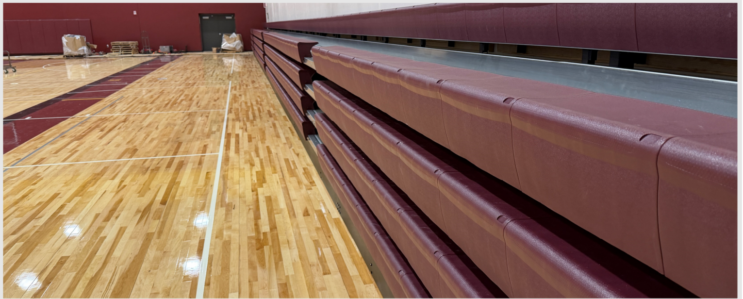
The north side gym bleachers have been installed.