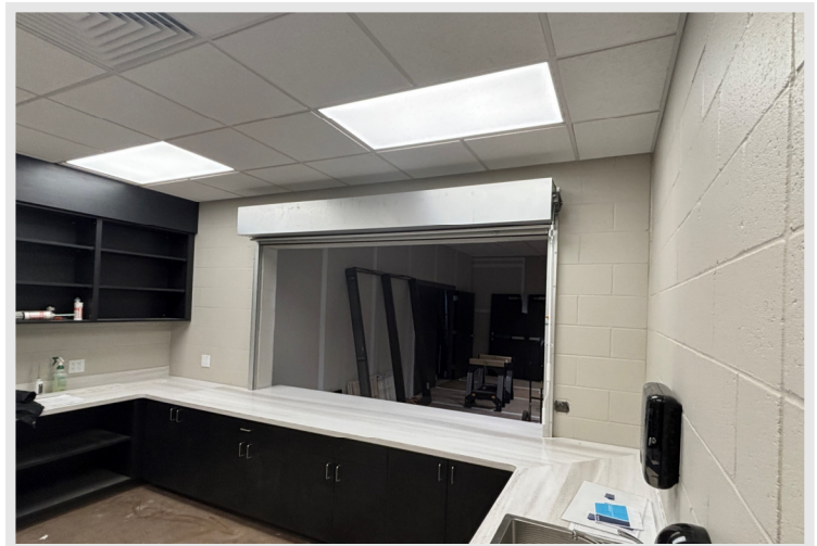
The new coiling door has been installed in the concession stand.