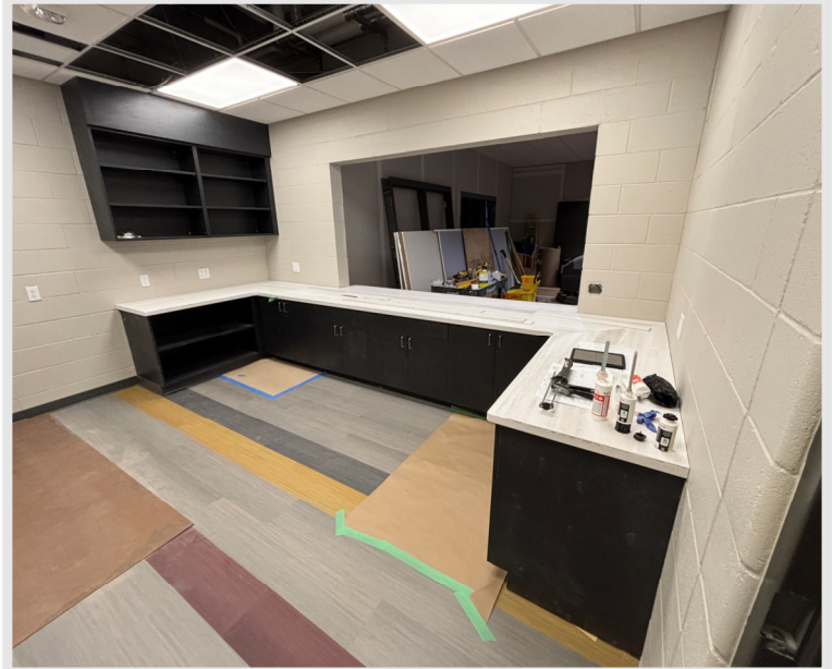
The casework and countertops in the new concessions stand have been installed.