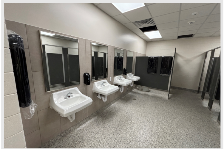
Mirrors, paper towel dispensers, grab bars and more have been installed in the addition restrooms.