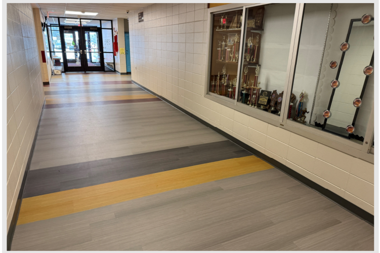
The flooring in the Middle School was completed over winter break.

Along with most other spaces wrapping up, the gymnasium is also reaching the finish line. Floor painting and finishing has been completed. Soon the new bleachers will be installed, and the space will be all set for the grand opening.