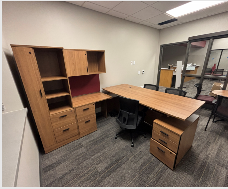
The furniture has been moved into the new middle and high school office.

/////////////////////////////////1200 North Street • Rib Lake, WI /////////////////////////////////// PAGE 2