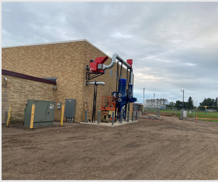
The dust collector installation has begun outside of the woodshop. The final interior and exterior connections are next.

/////////////////////////////////1200 North Street • Rib Lake, WI /////////////////////////////////// PAGE 2