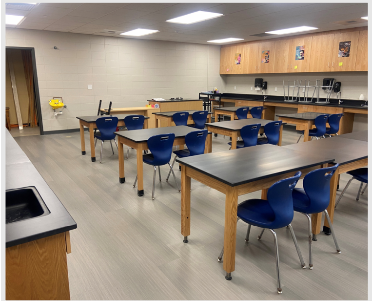
The middle school science room has received the finishing touches on the countertops and casework giving the room a nice, new feel.