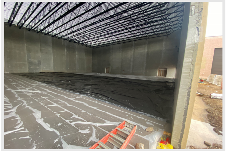
The gym slab has been poured and covered with plastic for the curing process.

The Addition this week reached another milestone as the Gym Floor was poured! It took over 150 yards of concrete to complete this pour. The structural steel framing for the front corridor is ongoing with the vestibule columns and decking completed.