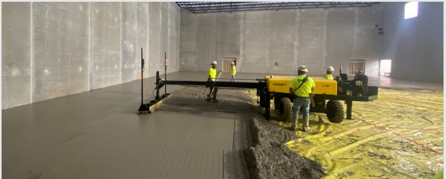
A laser screed was used to make sure the concrete was flat, level, and poured to the correct height.