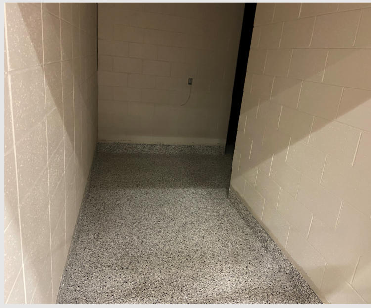
The epoxy flooring and cove base have been installed in the middle school locker rooms.

//////////////////// 1200 North Street • Rib Lake, WI ////////////////////// PAGE 2