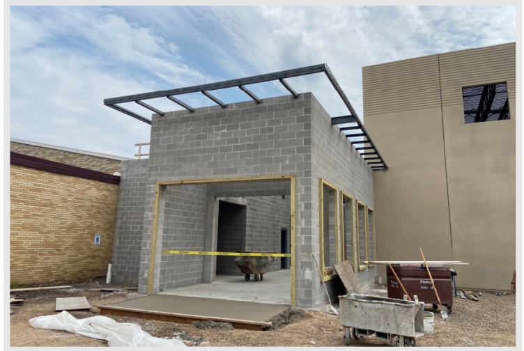
The north addition vestibule CMU and structural steel have been completed.

In the high school, work has begun to wrap up inside of the wood shop as the mechanical and electrical contractors finish up their installations. The corridors throughout the building are receiving their new ceiling grid and tile, while the library has started to get put back together, as a temporary lunchroom.