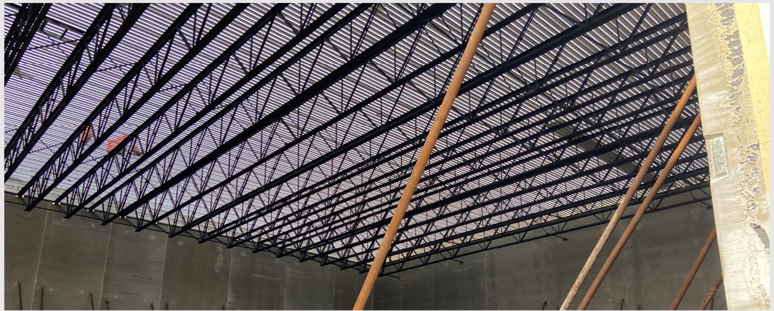
The long span joists and roof decking have been installed above the new gym.