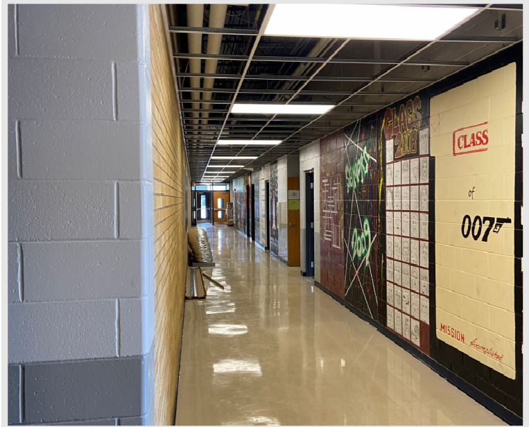
Ceiling grid and border are getting installed in the high school corridors.